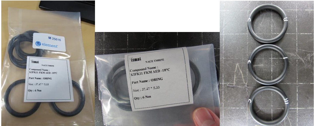
Figure A.1: As received material/before start of RGD: KIFK11 FKM AED