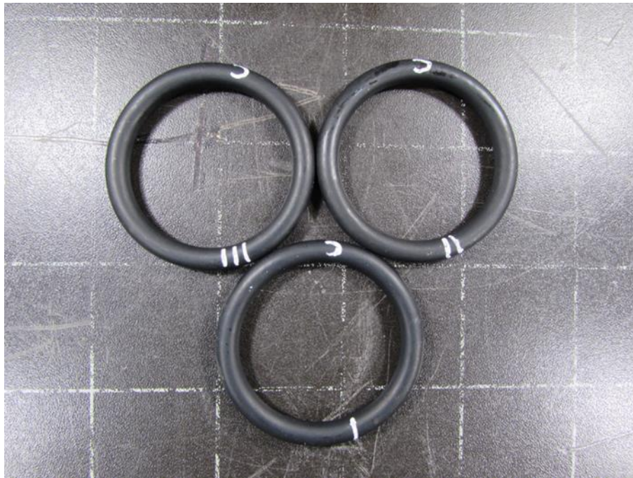
Figure B.1: After RGD: KIFK11 FKM AED