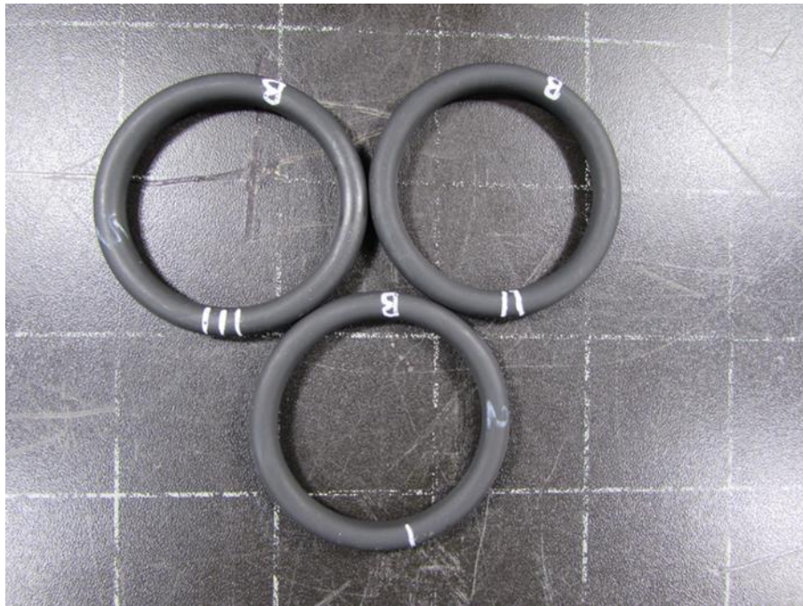
Figure B.1: After RGD: KIFK15 FKM GLT AE1 AED -46C