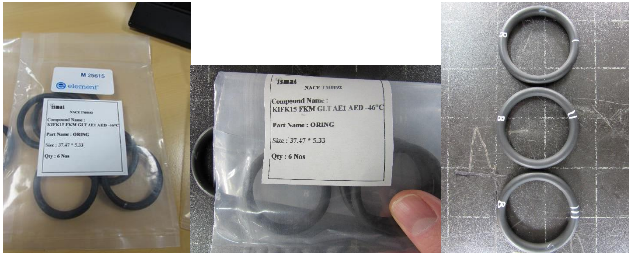
Figure A.1: As received material/before start of RGD: KIFK15 FKM GLT AE1 AED -46C